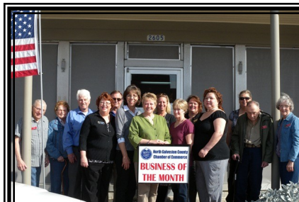
North Galveston County Chamber of Commerce named MI Lewis as Business of the Month